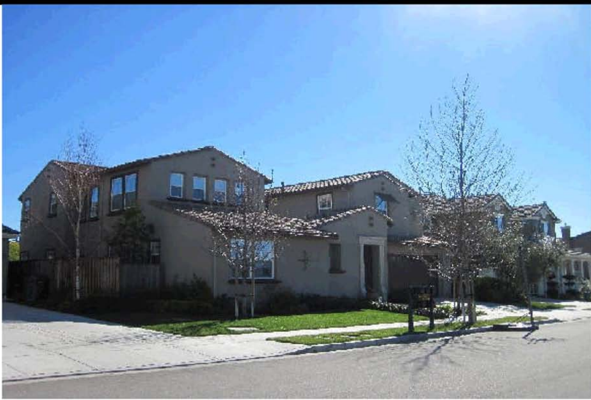
Additional photo #2 : Left Side