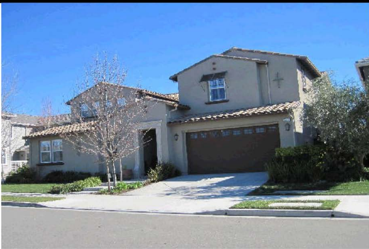
Supporting Photo #1 : 2833 Enfield St : Right Side