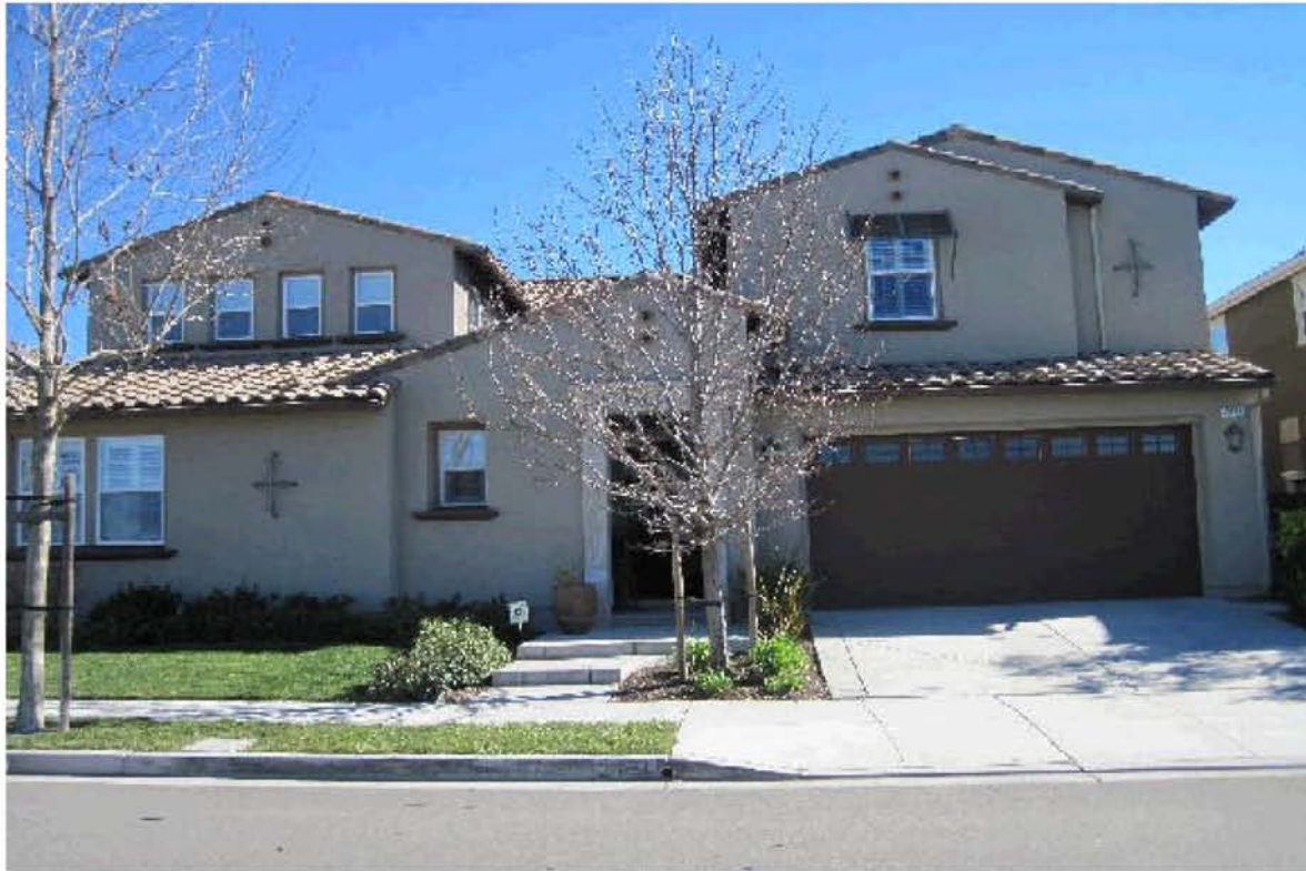
Subject Photo, Front #1 : 2833 Enfield St : Front

Occupied? YES The subject is owner occupied. Location? GOOD Subject is located in good and quiet neighborhood. No HOA. Close to shopping and schools. Easy access to freeway. Top rated schools for Bay Area. Mostly single family homes close to the subject's age. Condition? GOOD Stucco exterior and tile roof are in good condition. Professionally done landscaping. Good curb appeal. No exterior repairs needed. Any marketing defects in comparison to neighborhood? No There are no marketing defects in comparison to the neighborhood. Are there any external signs of deferred maintenance? No There are no signs of deferred maintenance. Is the property currently listed for sale? NO General Comments: The subject is in good overall condition and in a good overall location.