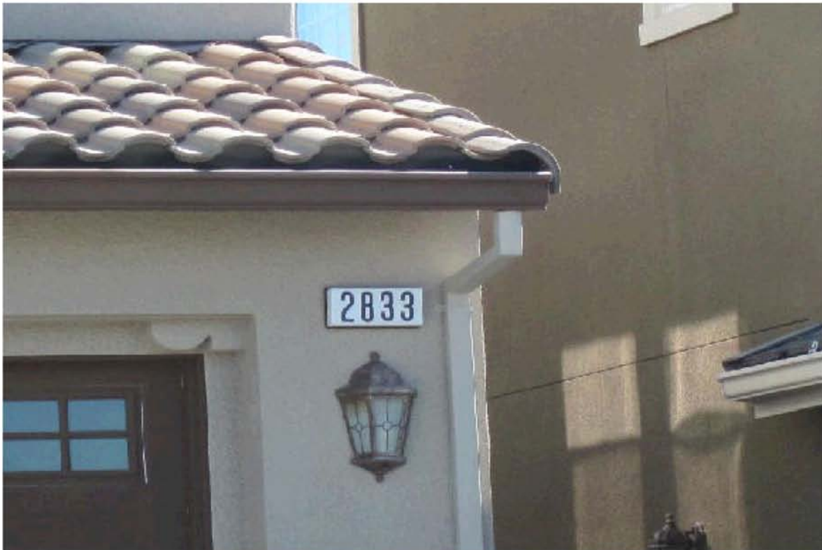
Additional photo #1 : 2833 Enfield St : Address Verification