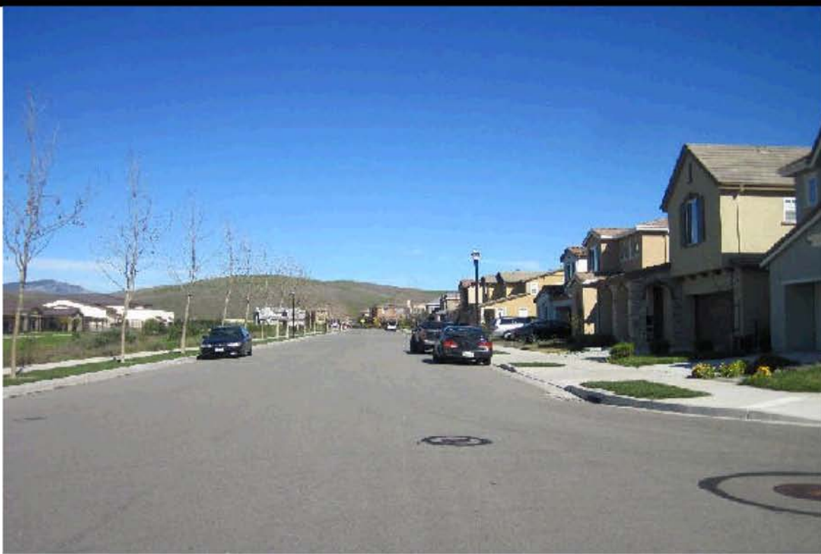
Street Scene #1 : 2833 Enfield St : Street Scene